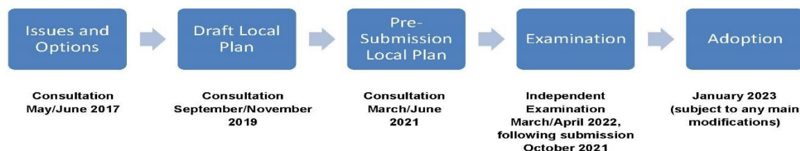
Figure 1: Local Plan Timescale