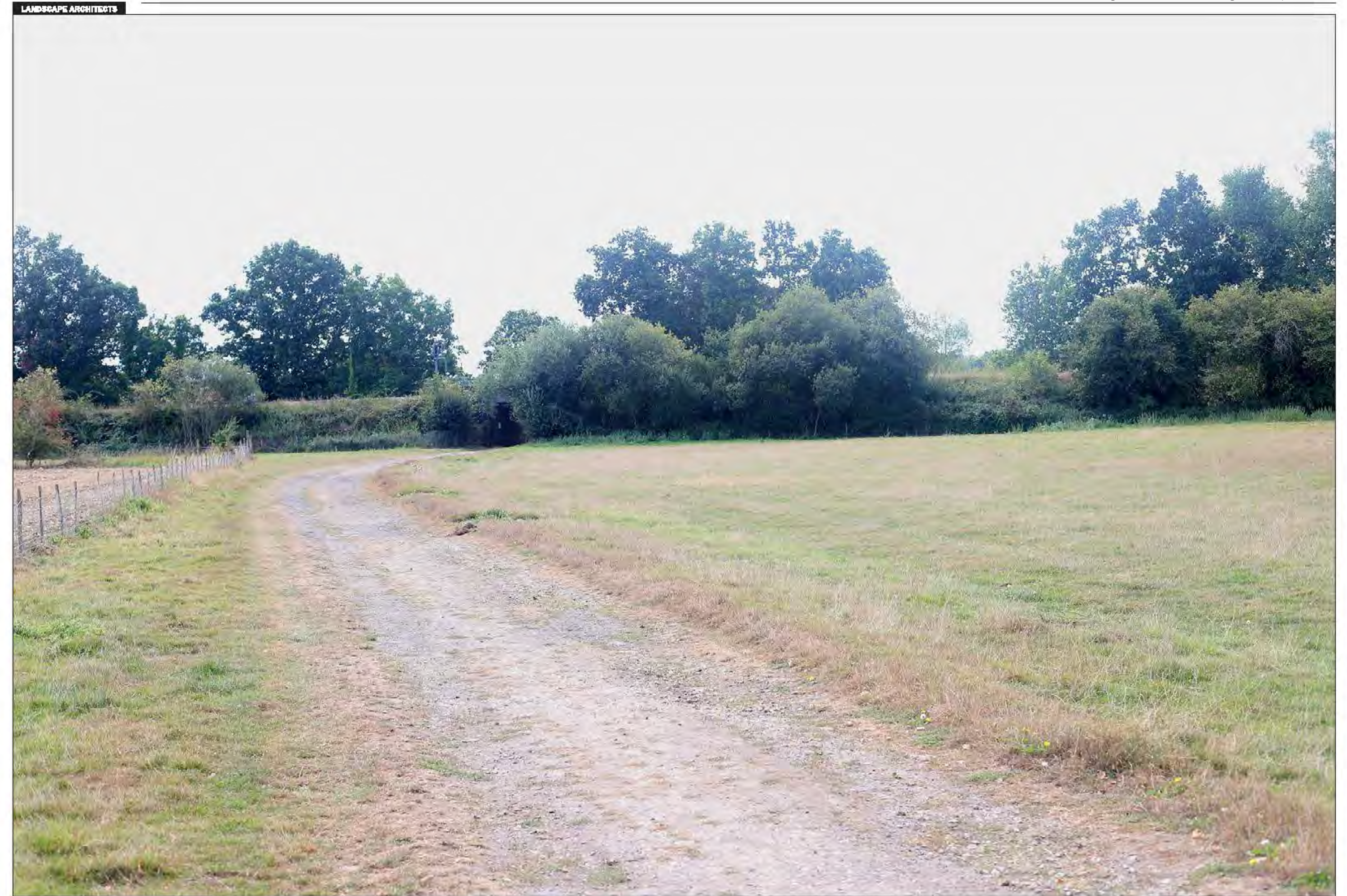
Project: 2739 Land at Finches Farm, Five Oak Green Road | Client: Rydon Homes Ltd | Date: October 2023 | Status: DRAFT

Photographic Sheets Photo Location 5: View looking south towards the Site along PRoW Footpath WT 158