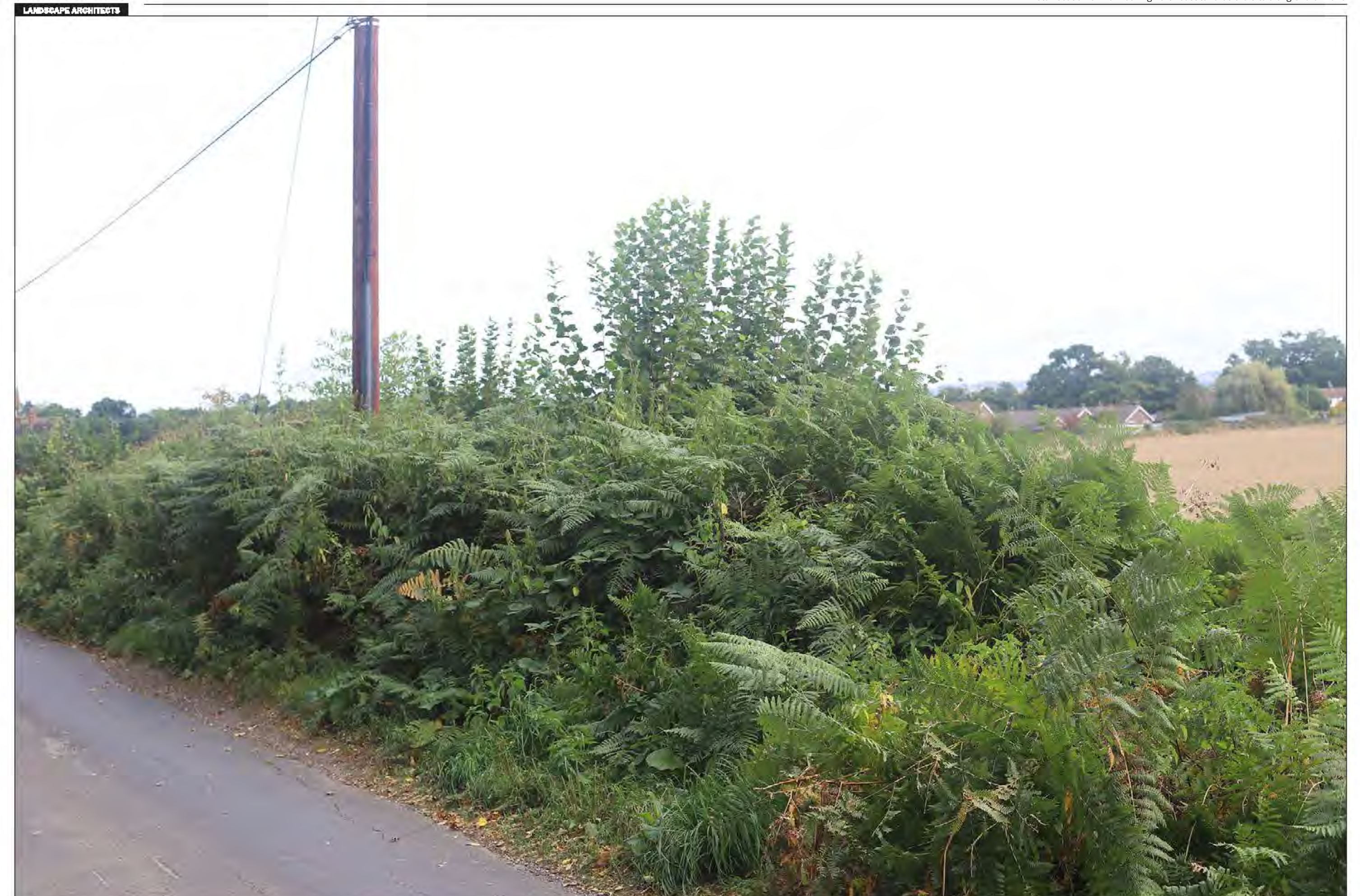
Project: 2739 Land at Finches Farm, Five Oak Green Road | Client: Rydon Homes Ltd | Date: October 2023 | Status: DRAFT